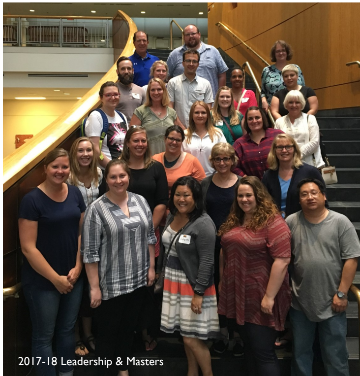
2017-18 Leadership & Masters

See the next page for all the participating members of Leadership, Masters, and the Committee.