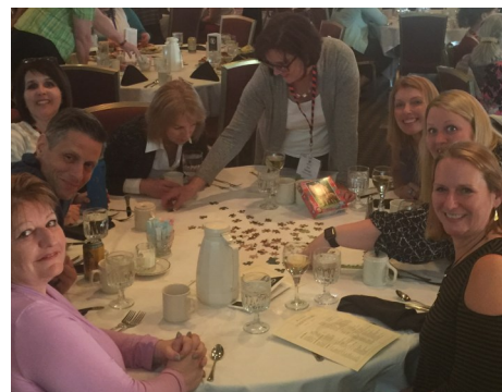
More from MAFAA Conference at Madden's 2017